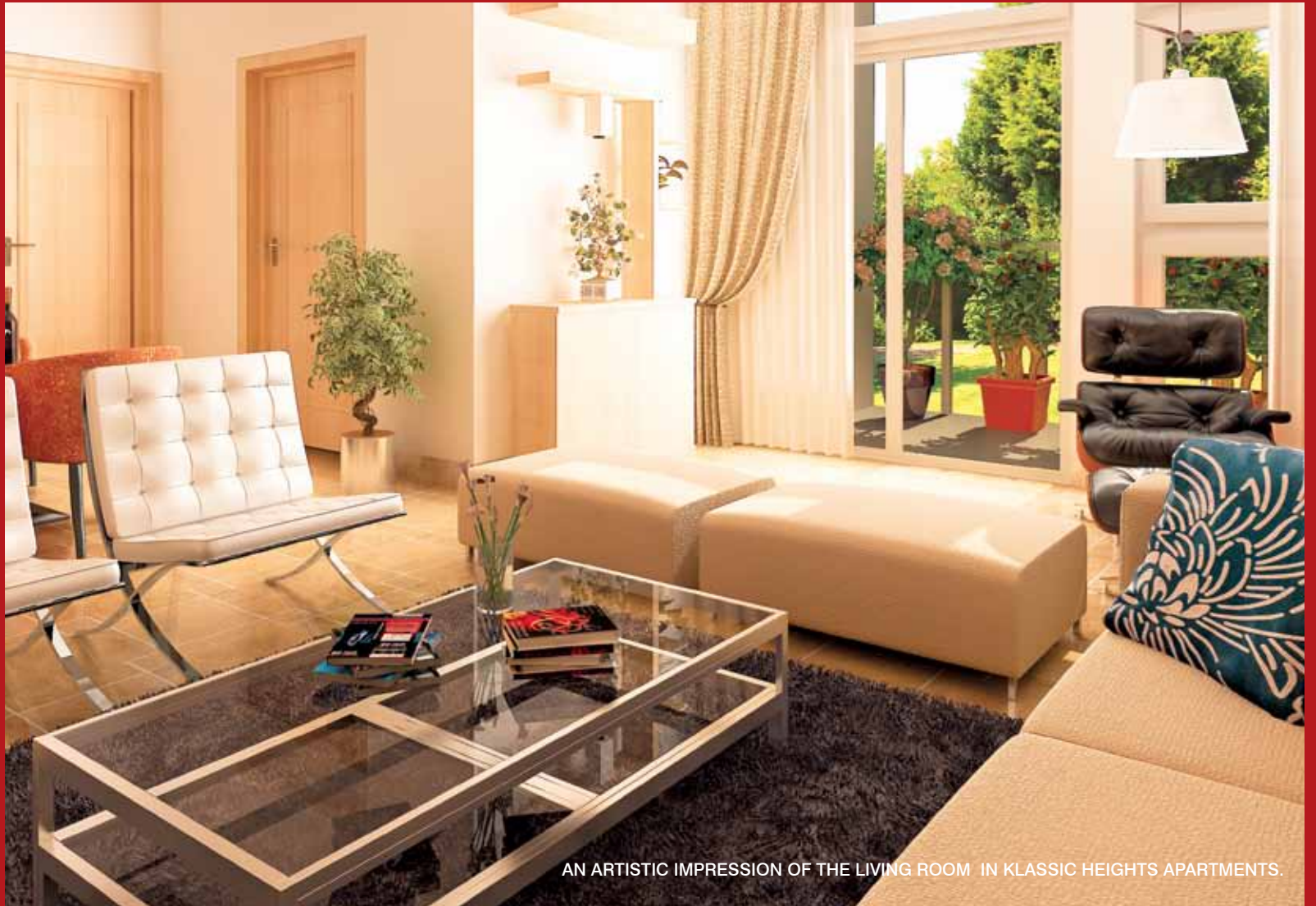
AN ARTISTIC IMPRESSION OF THE LIVING ROOM IN KLASSIC HEIGHTS APARTMENTS.